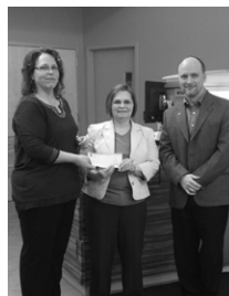
Widows and Orphans Food Bank in Stetson