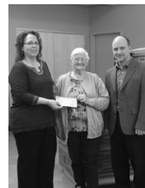
Tri-Town Food Pantry