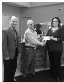
Pittsfield Food Bank

We would like thank all of our hard working employees and very generous members for making the 2015 Ending Hunger in Maine Campaign so successful!