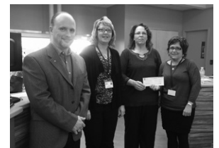
Sebasticook Family Doctors/RSU #19 Snack Pack Program

Sebasticook Valley FCU serves members who live, work, attend school, or worship in the towns of Pittsfield, Newport, Corinna, Burnham, Detroit, Dixmont, Etna, Hartland, St. Albans, Stetson, Palmyra, Plymouth, Cambridge, Dexter, Exeter, Garland, Harmony and Ripley . Immediate family members of existing members are also eligible to join. If you know of someone who would benefit from doing business with your Credit Union have them call or stop by today.